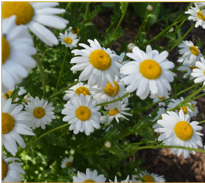
Earth laughs in flowers. – Ralph Waldo Emerson

Saturday, October 12, 4 PM – 7 PM An event celebrating all things pumpkin with carving contests for local businesses, pumpkin painting, food demos, activities, music, and a lighted pumpkin parade. Free.